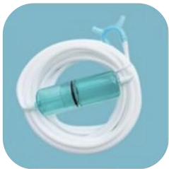
NC-A silicon Nasal Cannula