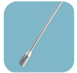
HR-A hydrogen rod