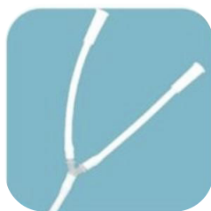
Y-L Long Y tube