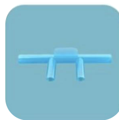
NC-N nose accessory