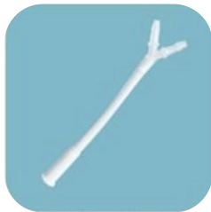
Y-S short Y tube